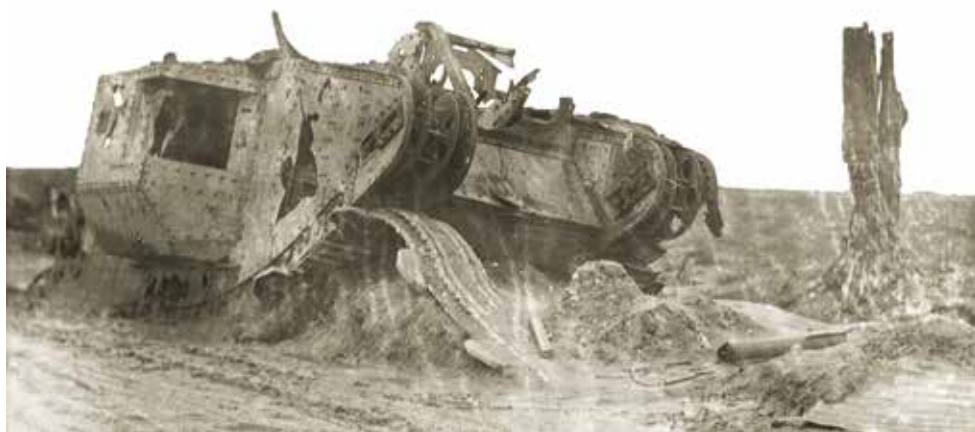
Top: Self-portrait with camera, Olive Edis, 1919, © Norfolk Museums Service (Cromer Museum) Above: Ruined tank on the Menin Road, Olive Edis, 1919 © Norfolk Museums Service (Cromer Museum)