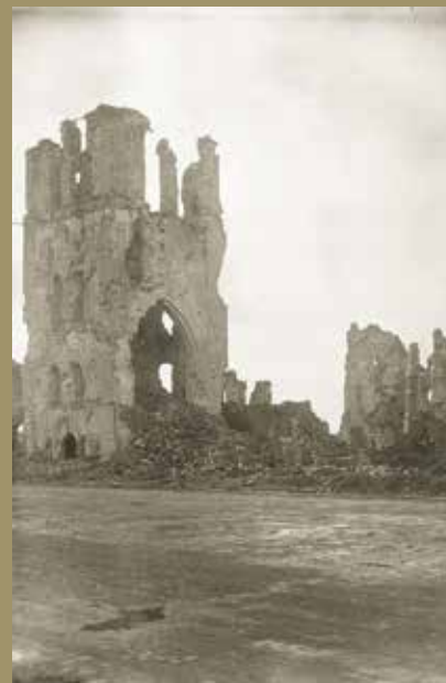
The Cloth Hall, Ypres, Olive Edis, 1919 © Norfolk Museums Service (Cromer Museum)