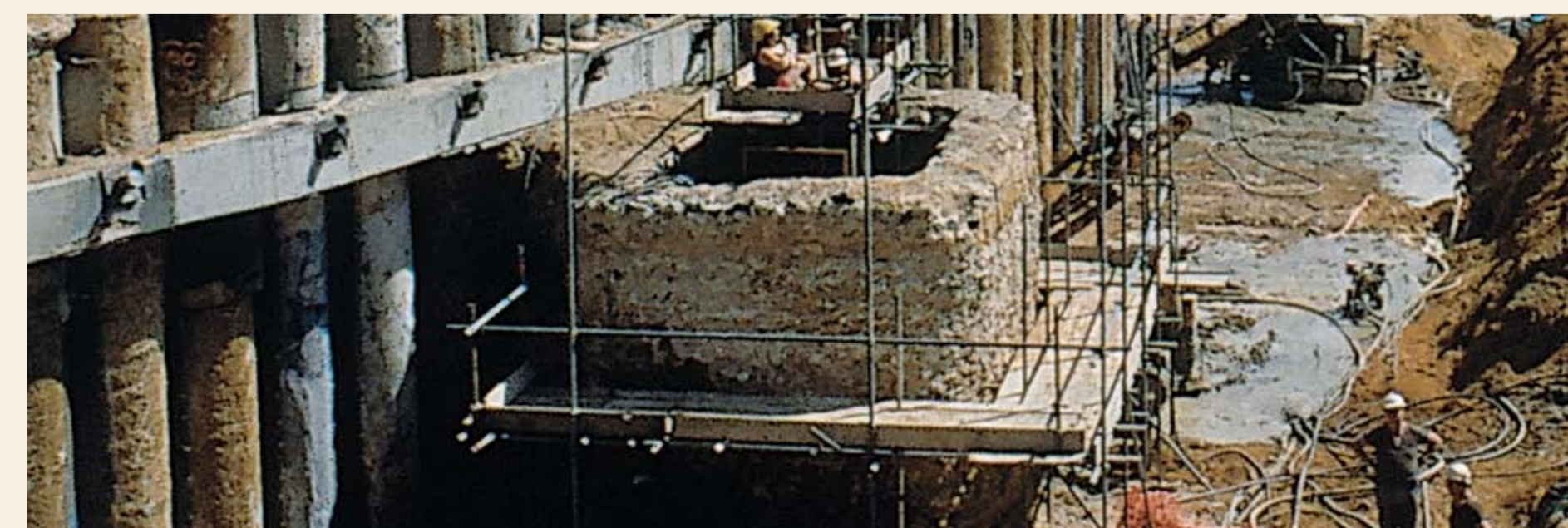
Excavating the 12th century well.