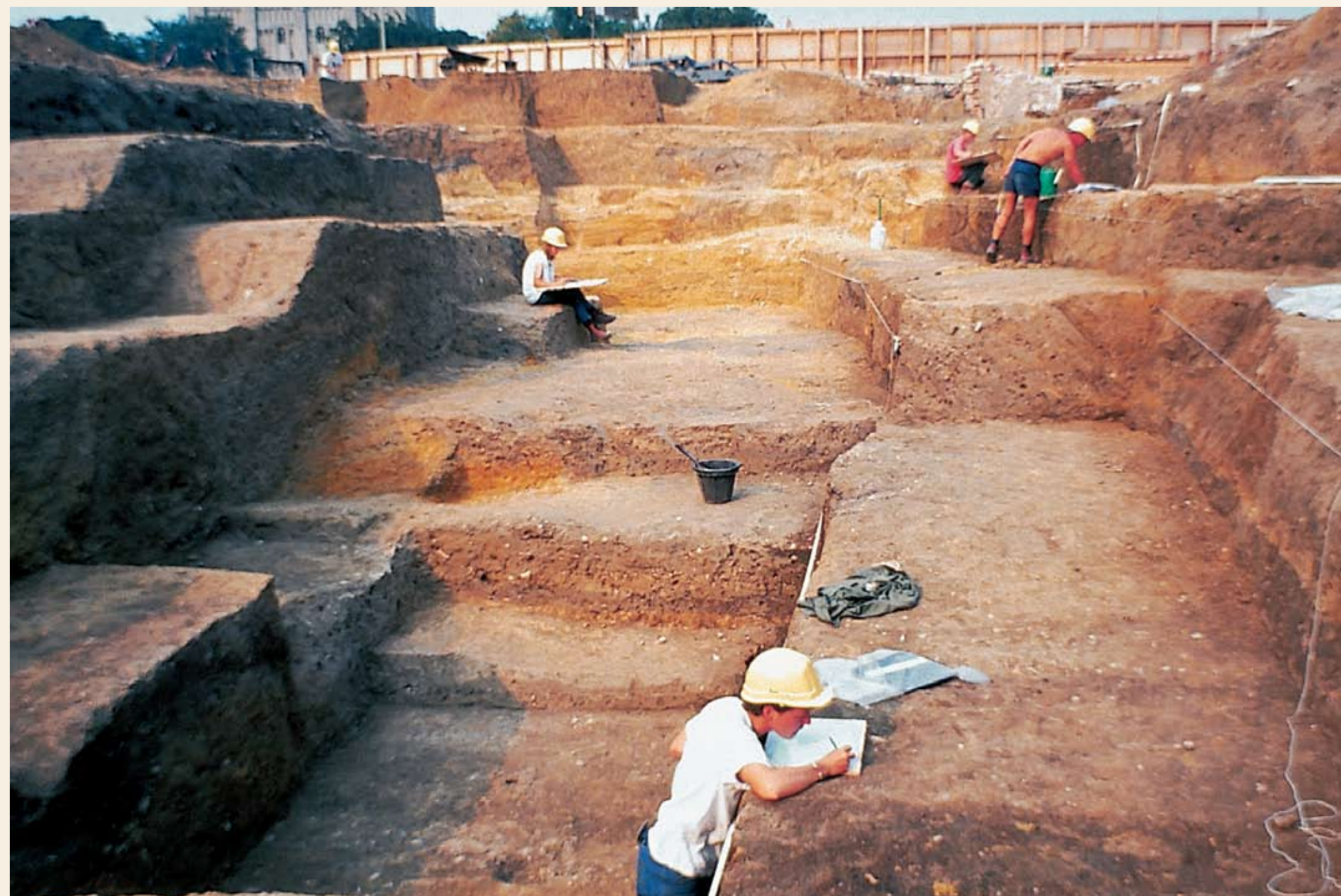
Archaeologists recording the rubbish infill of the south bailey ditch.