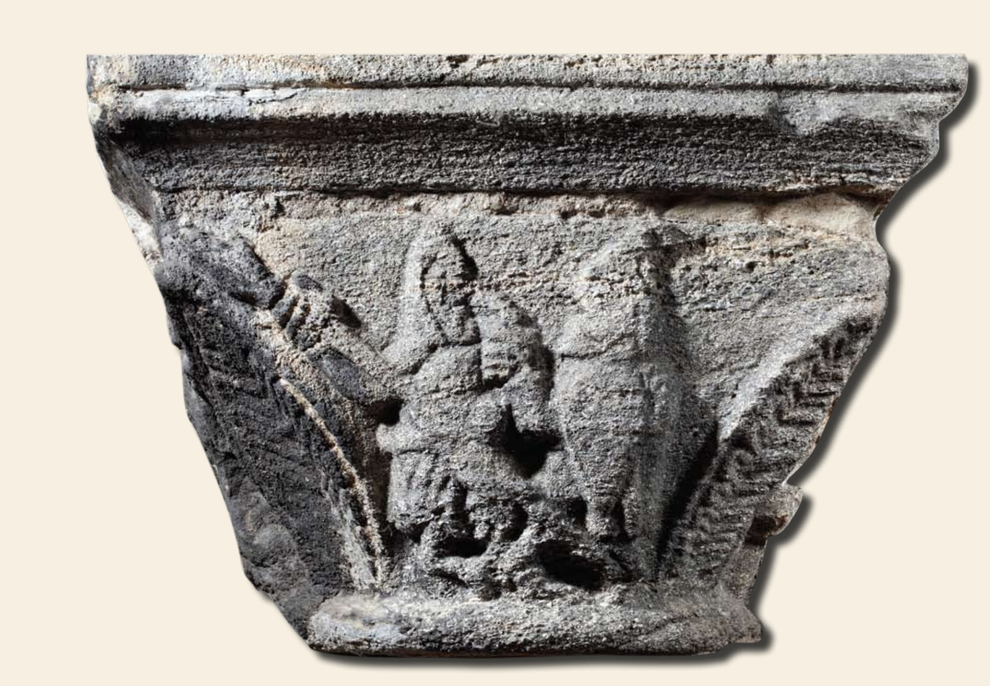
Two knights fighting. You can see this carving when you visit the chapel area on the modern balcony floor above you.