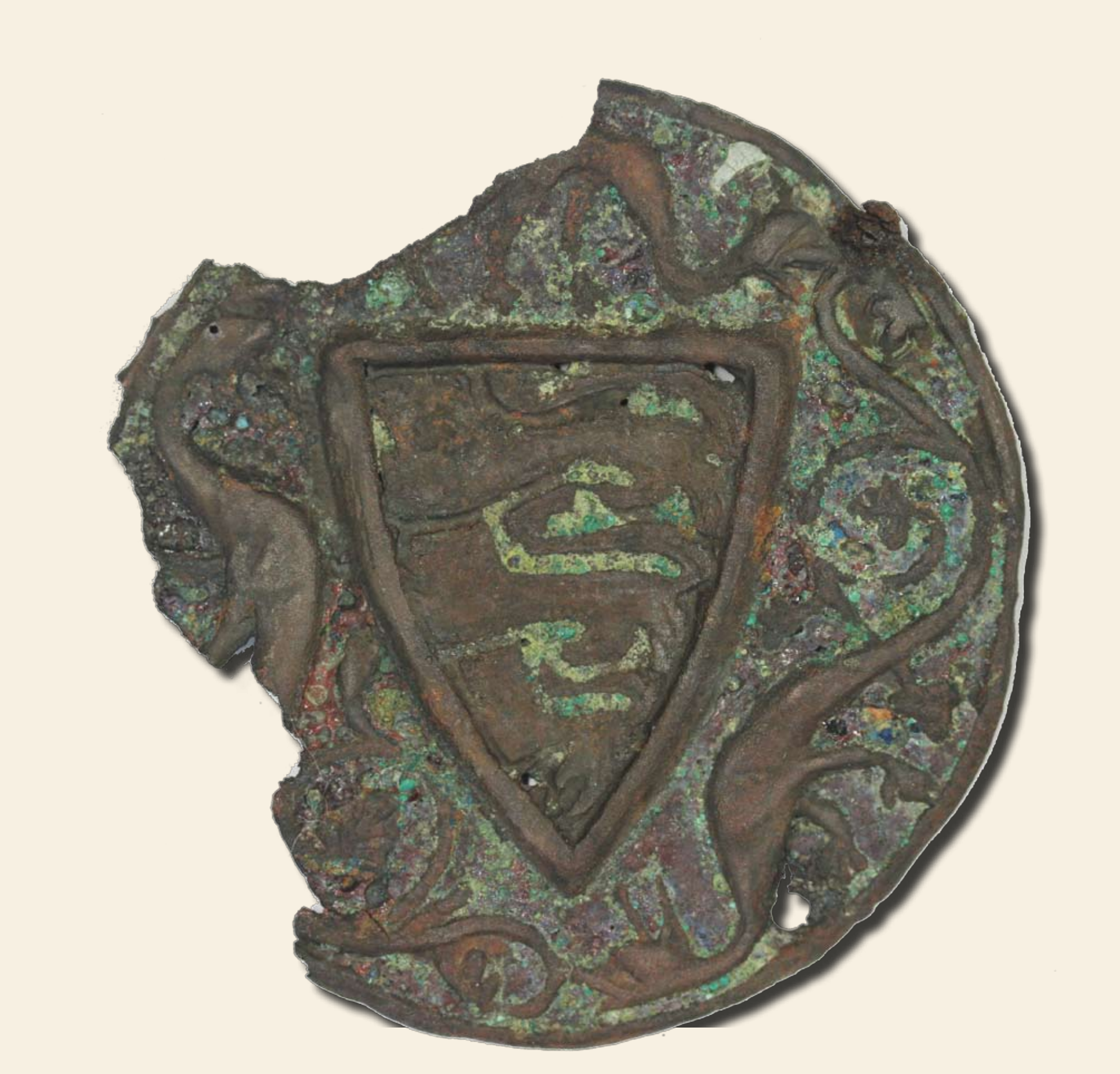
This plaque was originally attached to one of the stakes marking out the Castle Fee, or outer boundary. The Castle Fee was the King's land: anyone living or staying within the Fee was exempt from city taxes and laws.

The stone used to build Norwich Castle and Cathedral was quarried near Caen in Normandy and brought here by sea and river. The Keep is built in a style we call 'Romanesque', which developed in Normandy and flourished in England after the Norman Conquest. The layout of the Keep echoes developments in castle building established in Normandy, at sites including Mayenne, Doué and Loches.