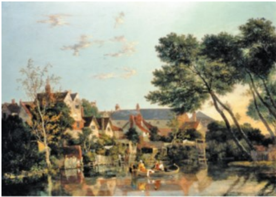
John Crome, Norwich River: Afternoon , oil on canvas, 1819

Learn how to use paintings effectively in the classroom. Take One Picture is an approach for primary schools developed by the National Gallery, and Norwich Castle is delighted to be its regional partner. One painting is used as inspiration for meaningful and creative cross-curricular work. We offer an introductory CPD session to explain the approach and give some practical examples to use in the classroom. It's a fantastic opportunity for whole-school projects such as Arts Week as well as smaller-scale creative