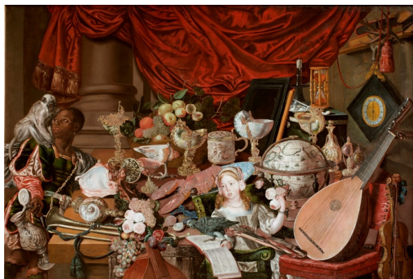
Unknown artist, The Paston Treasure , c. 1670