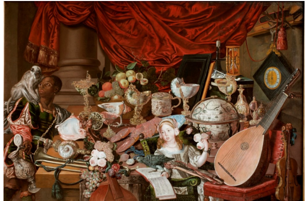
Unknown artist, The Paston Treasure , c. 1670