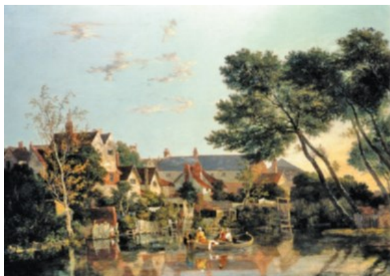
John Crome, Norwich River: Afternoon , oil on canvas, 1819

Learn how to use paintings effectively in the classroom. Take One Picture is an approach for primary schools developed by the National Gallery, and Norwich Castle is delighted to be its regional partner. One painting is used as inspiration for meaningful and creative cross-curricular work. We offer an introductory CPD session to explain the approach and give some practical examples to use in the classroom. It's a fantastic opportunity for whole-school projects such as Arts Week as well as smaller-scale creative