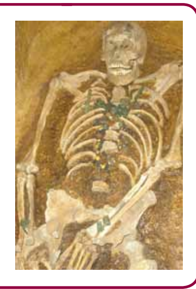
What kinds of things were buried with this Anglo-Saxon woman?

Draw on the pattern that has been removed from this small Viking object – known as Thor's Hammer .