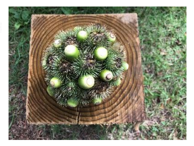
Landscape Orb (2020) Potato and acorns Ali Atkins