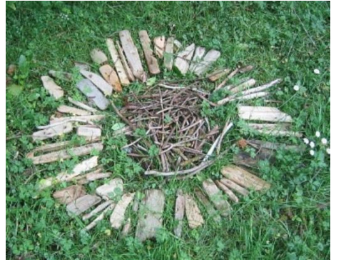
In this picture, you can see natural materials arranged into a circular formation.

A sculpture is a threedimensional (3D) work of art. Paintings and photographs are two-dimensional (2D) forms