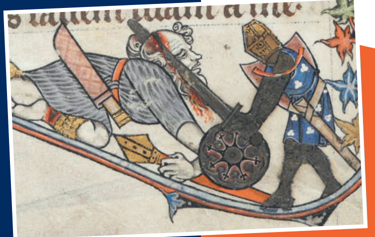
A knight defeats a giant (The Alphonso Psalter, 1284–1316, British Library)

We hope to reveal the fascinating history contained within the pages of this manuscript and many others through the meticulous digitisation of their contents. This will allow visitors to explore manuscripts far too delicate to handle, while preserving them for future generations.